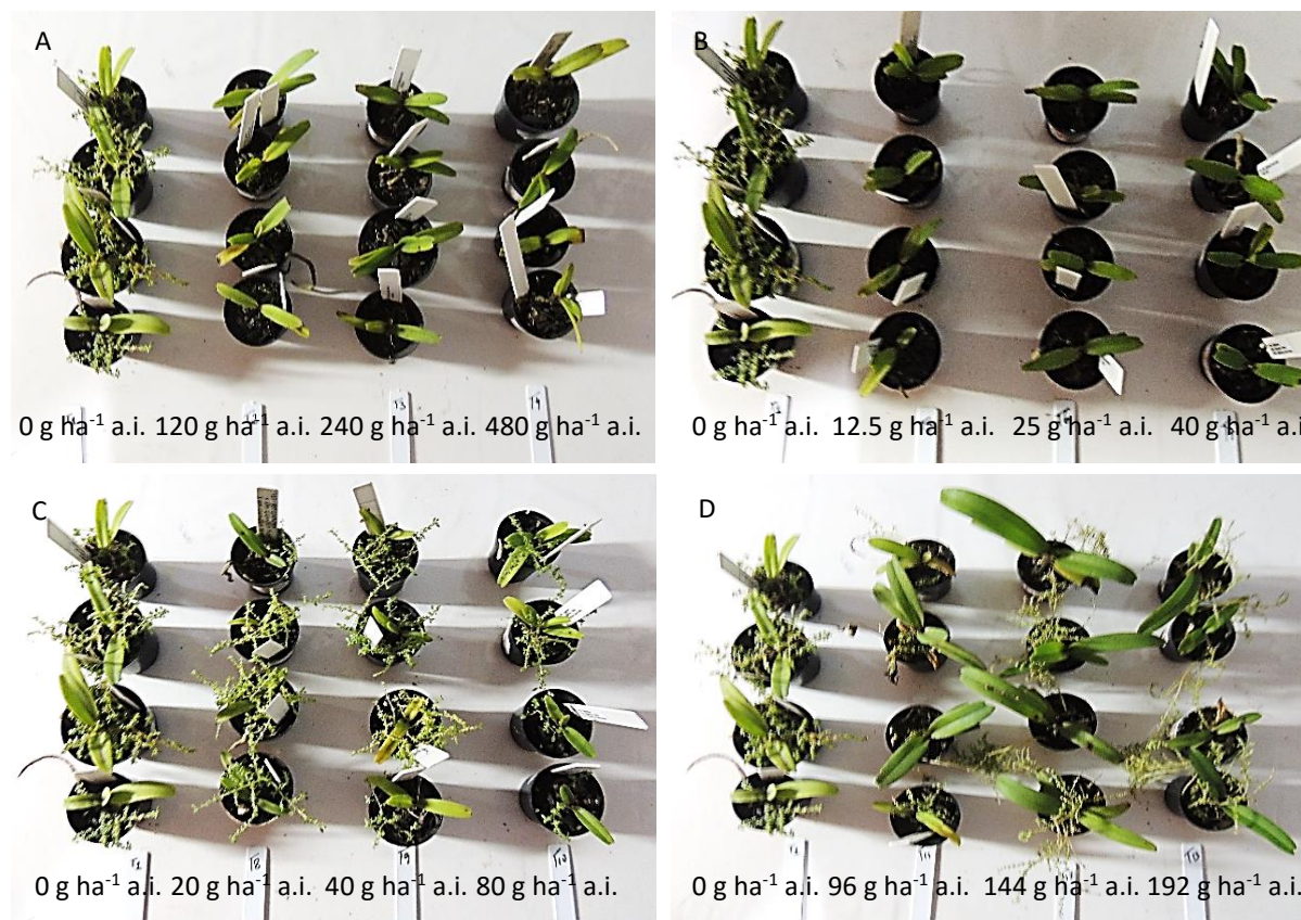
Figure 1. Aspects of seedlings of Rhynchosytilis ( Rhynchosytilis gigantea Alba x Rhynchosytilis gigantea ) X Rhynchosytilis gigantea Semi-Alba) and control of P. microphylla at 49 days after application of herbicides (A) oxyfluorfen, (B) flumioxazin, (C) nicosulfuron, and (D) mesotrione.

and 1B respectively), while the other molecules have not provided this effect. Both herbicides (oxyfluorfen and flumioxazin) molecules are absorbed by leaves and the roots, and have great persistence in soil, increasing and prolonging its effect (Jursík et al., 2011; Jung, 2011), justifying the results observed in this test.